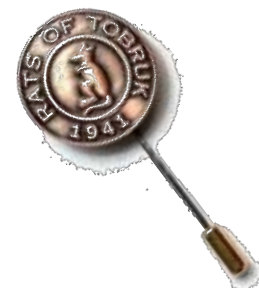
RATS OF TOBRUK 1941 LAPEL BADGE $15