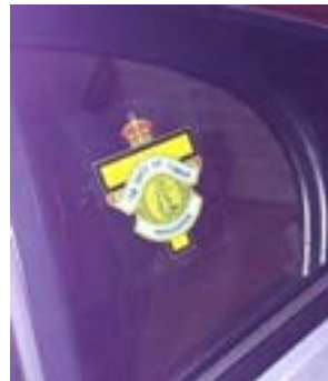
ROTA BADGE CAR WINDOW STICKER 7cm x 8.5cm approx Sticks to inside of window $10