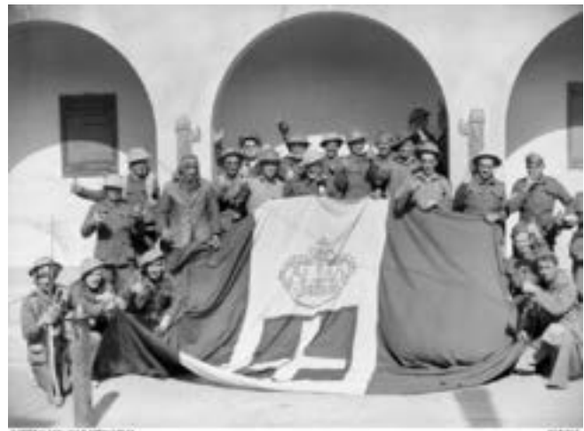
January 23, 1941, Australians tear down the Italian flag after they have penetrated the Italian defences.

In December 1940, the 6th Australian Division was moved forward from training camps around Alexandria to relieve British troops around Bardia and at the end of December they were ordered to prepare to attack. On 3 January 1941, the 2nd AIF took part in the first major Australian battle of World War II at Bardia, Libya, when battalions of the 6th Australian Division penetrated the defences of the Italian stronghold. Despite some heavy resistance the town fell to the Australians just two days later. On 22 January 1941, the Italian held Tobruk fell to the AIF and 25,000 Italians became prisoners.