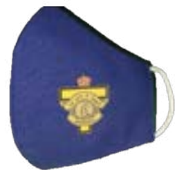
ROTA FACEMASK Small or large Special offer $7