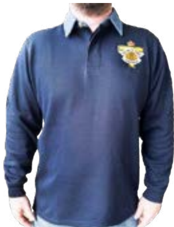
ROTA RUGBY TOP Sizes S, M, L, XL, XXL XXXL, XXXXL, XXXXL $60