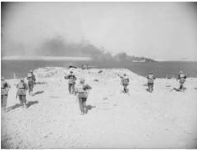
January 22, 1941- Australian troops advance upon an Italian gun position along the inner circle of the Tobruk defences.