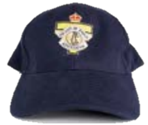
ROTA 'BASEBALL' CAP One size fits all $20