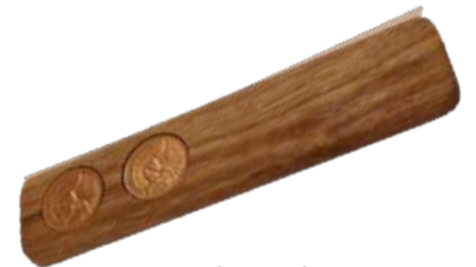
TWO-UP SET Includes kip and two 1941 pennies $20