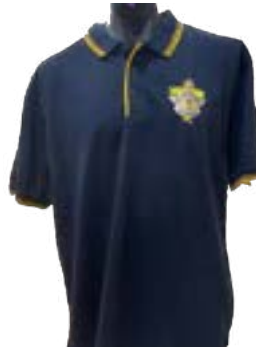
ROTA POLO SHIRT Sizes S, M, L, XL, XXL XXXL, XXXXL, XXXXL $50