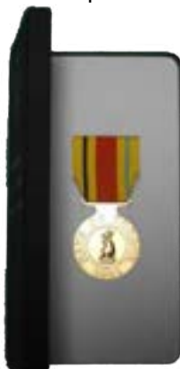
80 TH ANNIVERSARY SIEGE MEDAL (Limited Stock remaining) $50