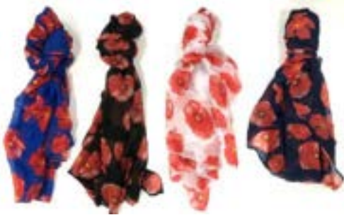
LADIES SUMMER POPPY SCARF Light Blue, Dark Blue, White, Grey, Black $15