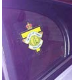
ROTA BADGE CAR WINDOW STICKER 7cm x 8.5cm approx Sticks to inside of window $10