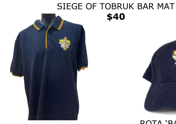
ROTA POLO SHIRT Sizes S, M, L, XL, XXL XXXL, XXXXL, XXXXXL $50

80<sup>TH</sup> ANNIVERSARY SIEGE MEDAL (Limited Stock remaining) $50