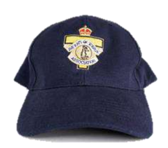
ROTA 'BASEBALL' CAP One size fits all $20