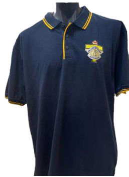
ROTA POLO SHIRT Sizes S, M, L, XL, XXL XXXL, XXXXL, XXXXXL