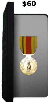
80 TH ANNIVERSARY SIEGE MEDAL