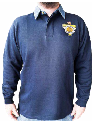
ROTA RUGBY TOP Sizes S, M, L, XL, XXL XXXL, XXXXL, XXXXXL