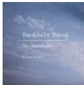
'RATS OF TOBRUK' CD INCLUDES 'NO SURRENDER'