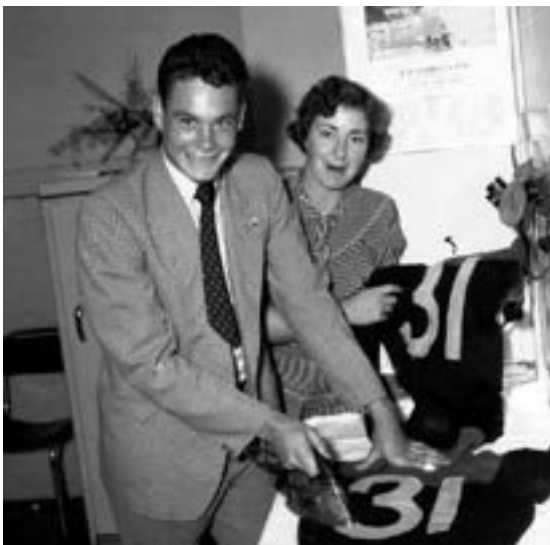
Barassi Jr. and his mother before his VFL debut