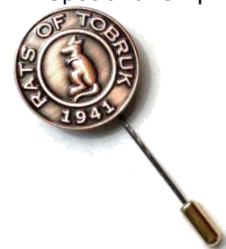
RATS OF TOBRUK 1941 LAPEL BADGE