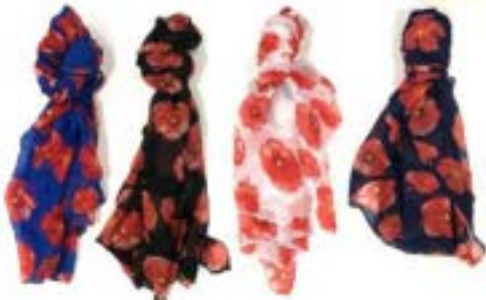
LADIES SUMMER POPPY SCARF Light Blue, Dark Blue, White, Grey, Black

See Order Form on page 13 for postage costs and other details.