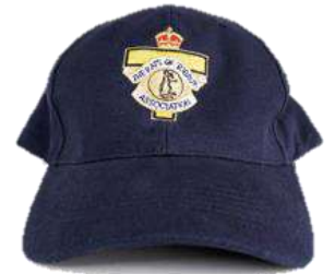
ROTA 'BASEBALL' CAP One size fits all