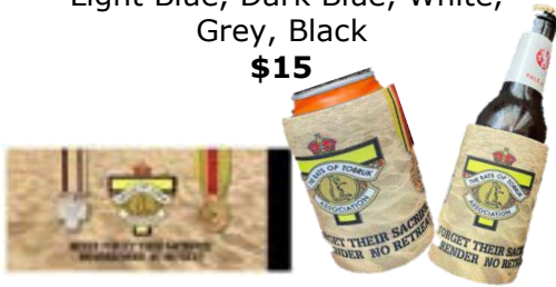
SIEGE OF TOBRUK 'ROLL-UP' STUBBIE COOLER