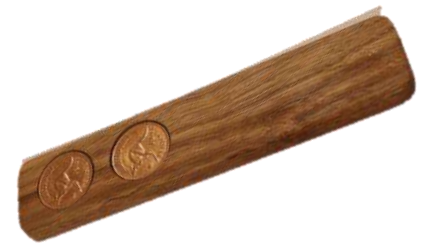
TWO-UP SET Includes kip and two 1941 pennies