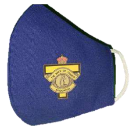
ROTA FACEMASK Small or large Special offer $7