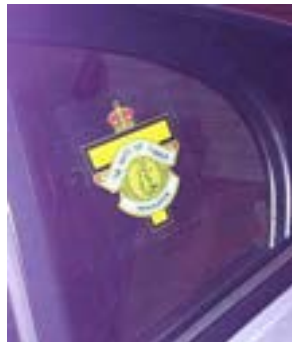
ROTA BADGE CAR WINDOW STICKER 7cm x 8.5cm approx Sticks to inside of window